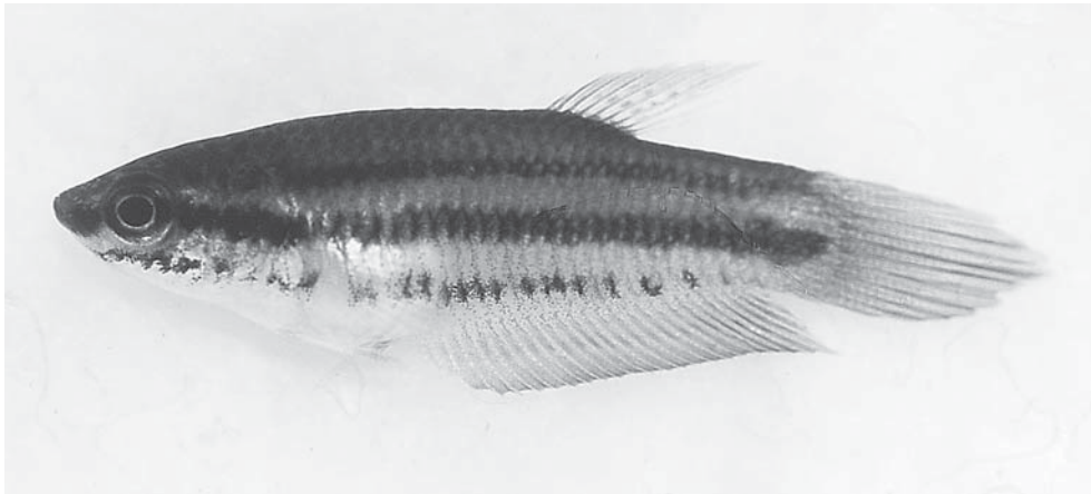
Fig. 2: Betta pallida spec. nov., female, paratype.